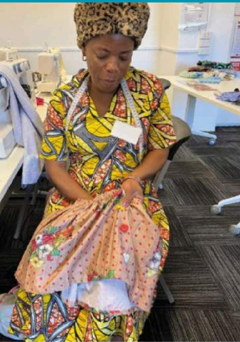
ABOVE: A SewAid program on the Gold Coast has been teaching refugee and migrant women basic sewing skills since 2022.