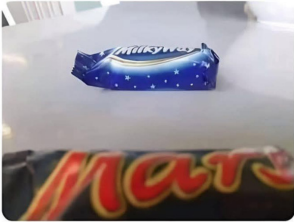
A very rare photo of the Milky Way viewed from Mars