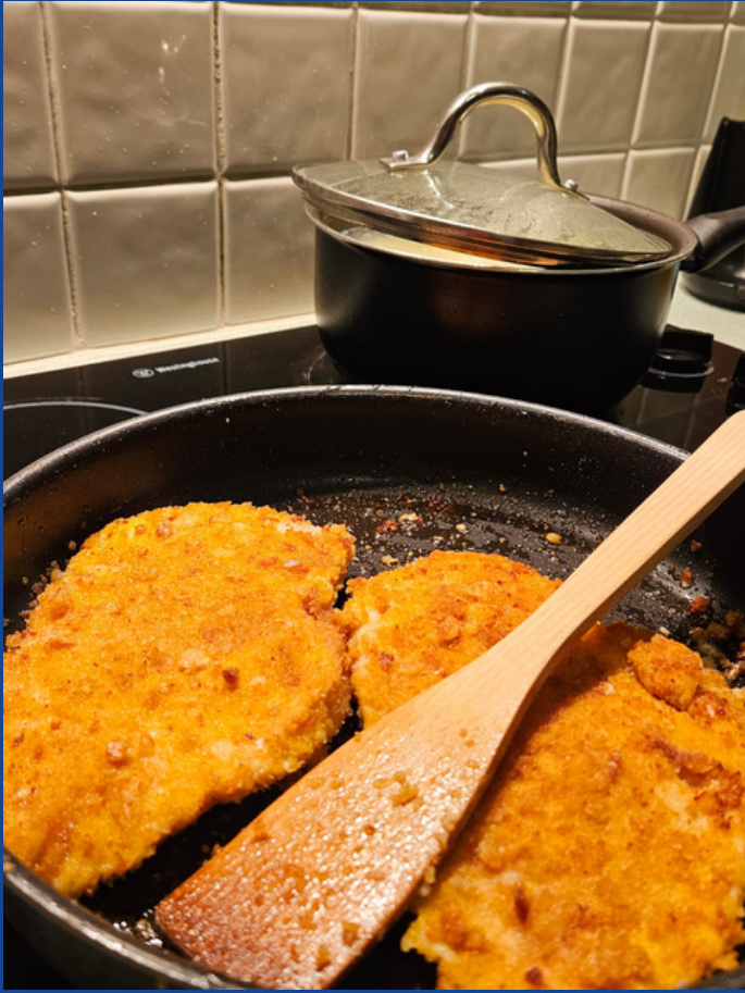
German Schnitzel & Czech Cucumber salad