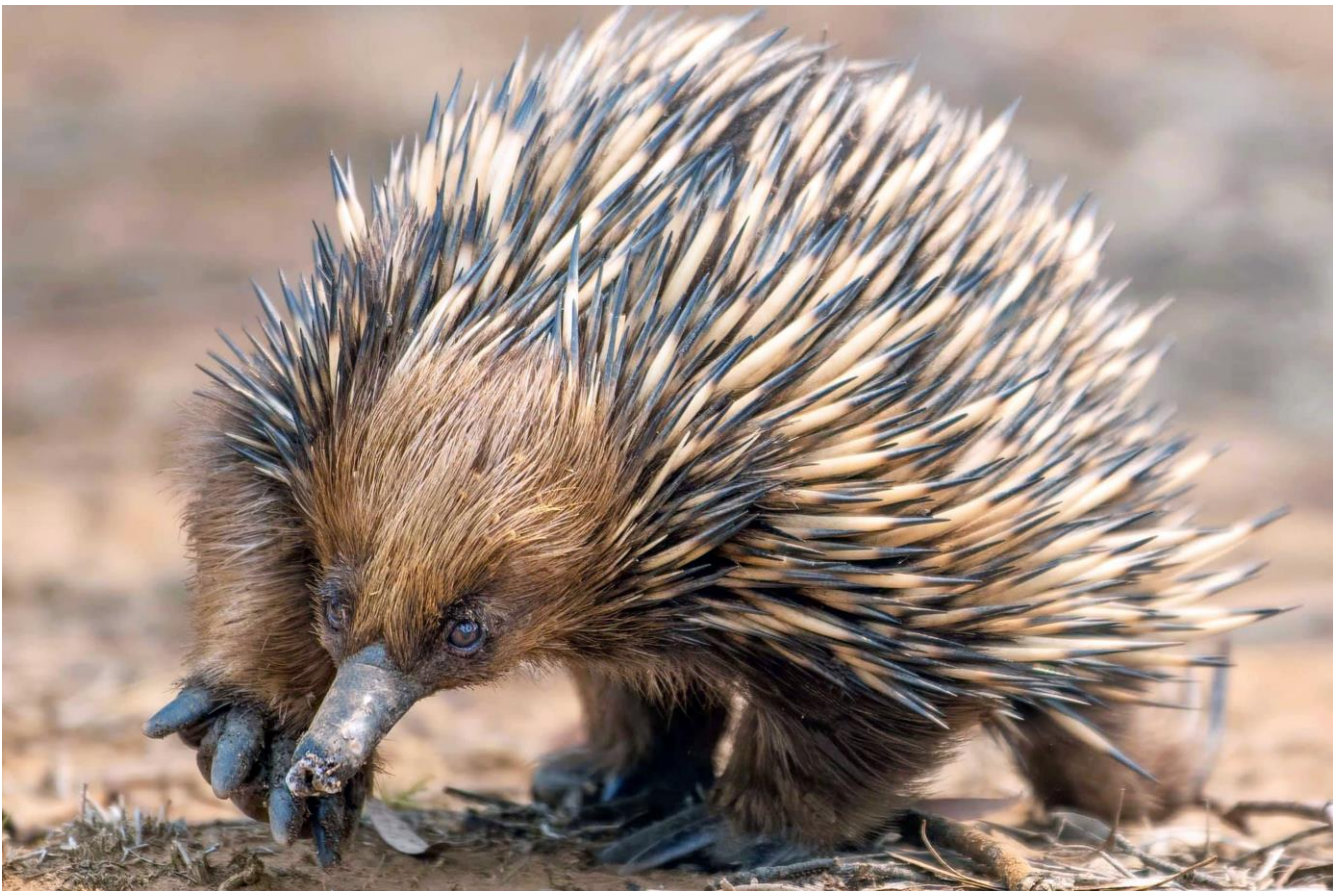
Another Australian icon suffering serverly from the bushfires - great photo - David Hinwood