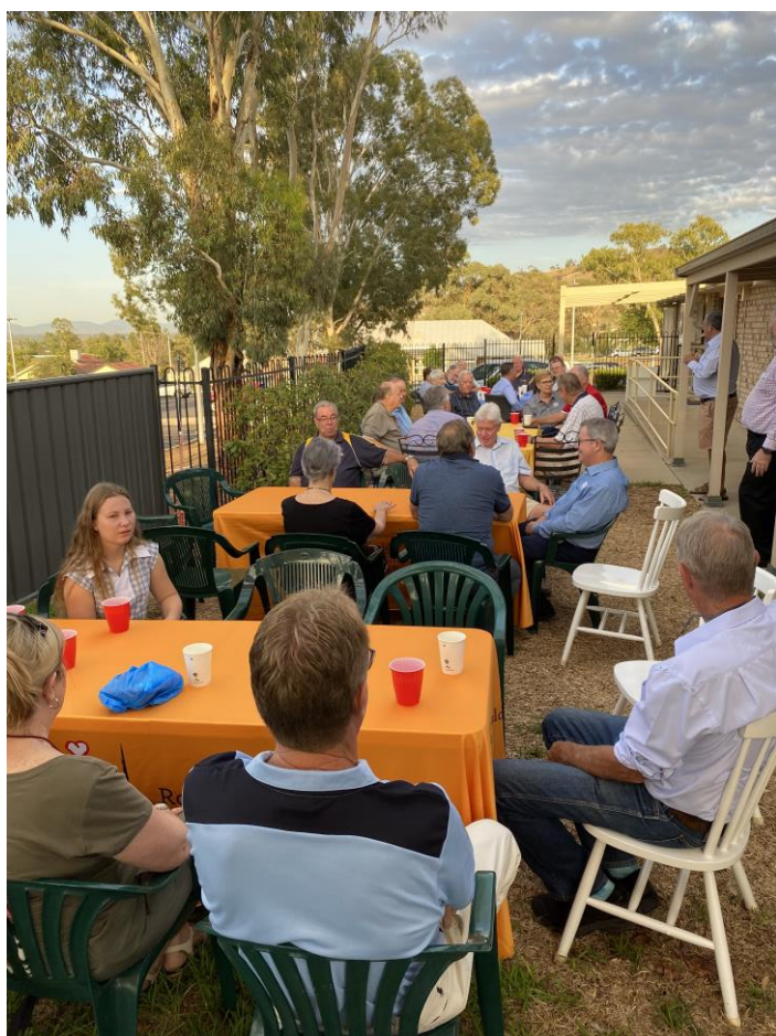
Tables and chairs and table-cloths enticed a crowd of Rotarians to breakfast