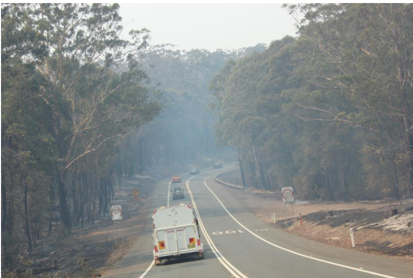
Photo of our evacuation from Manyana.

My thoughts are with all who have been tormented by the Bushfires. The damage to people’s lives and property will never be forgotten.