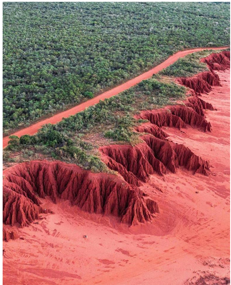
James Price Point - north of Broome WA