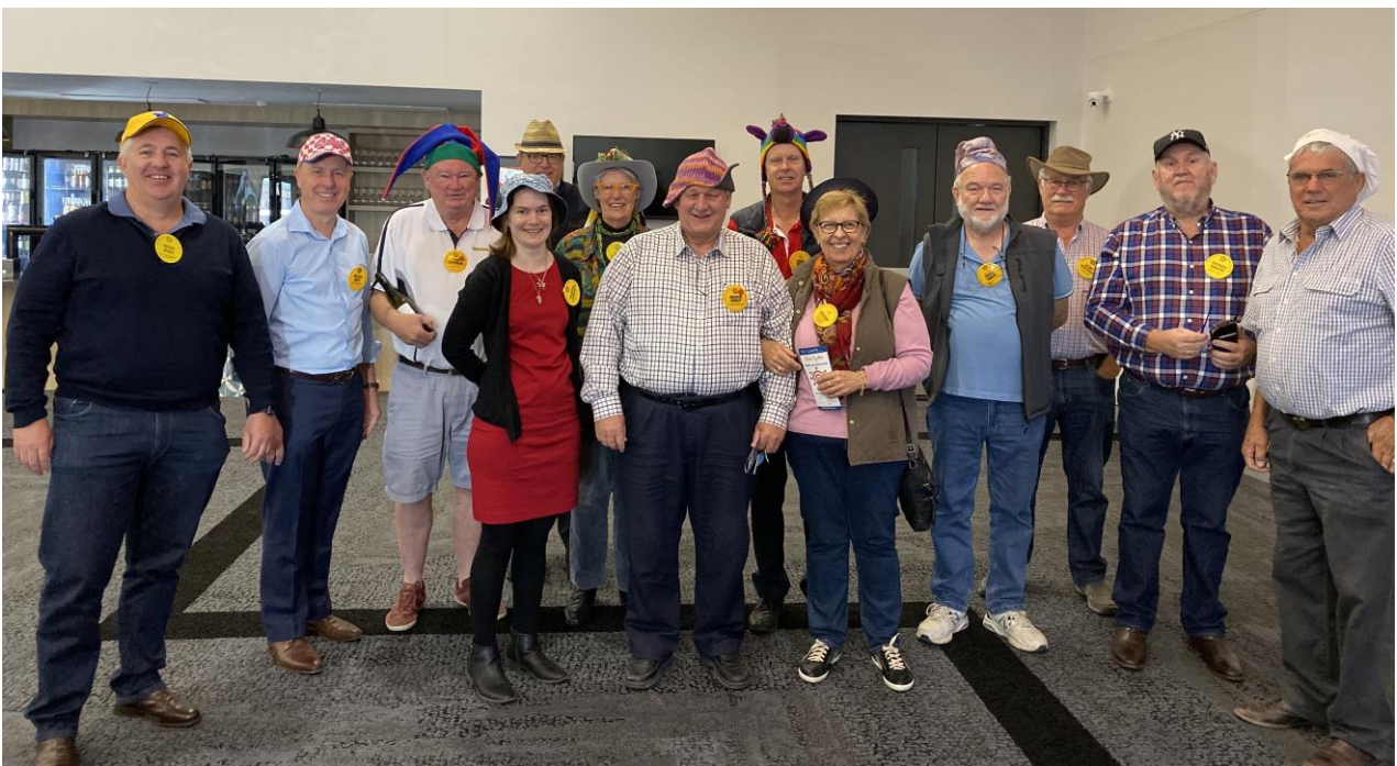
Hat Parade for Mental Health