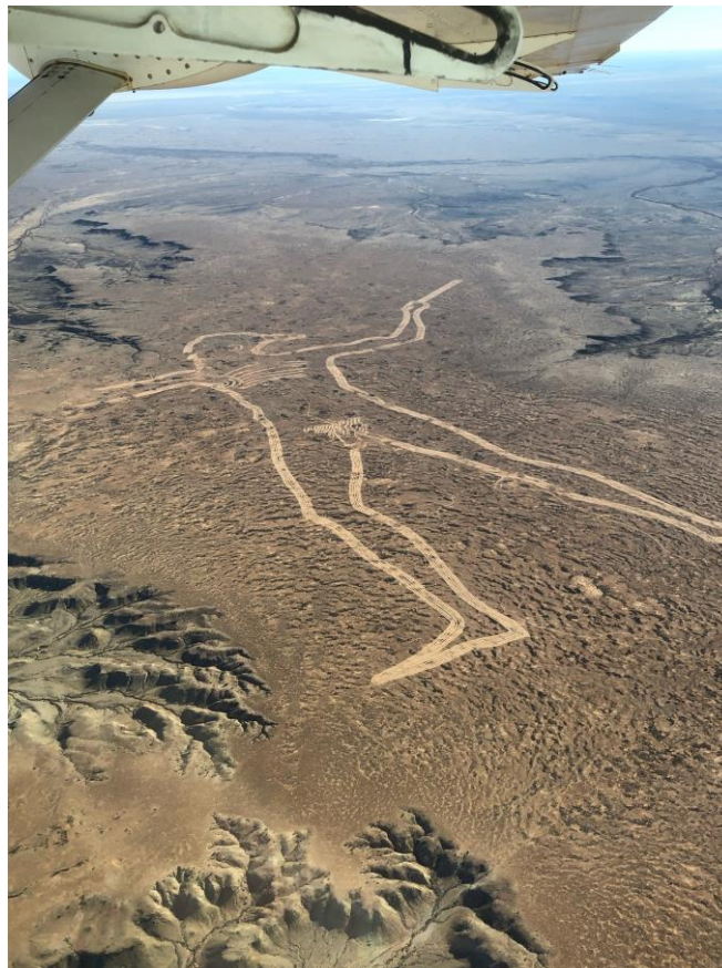
the "Maree Man" (re-chalked) out in the far far far west