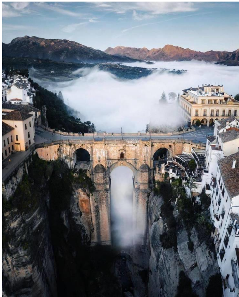
Fascinating cloud / fog formation