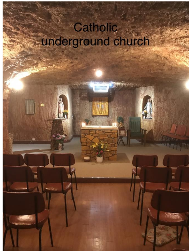
Catholic underground church

One way of beating the heat - build the church underground - same temperature all year! Thank you - Rob Clifton