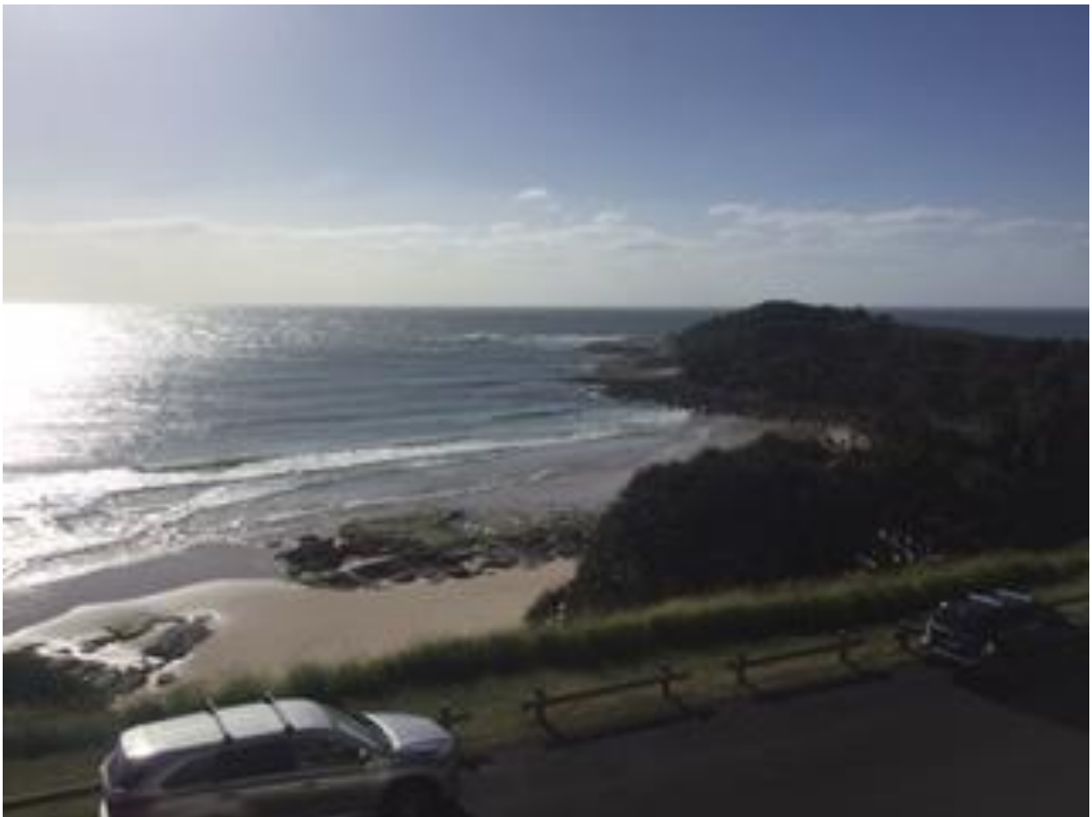
Sunrise looking over Convent Beach at Yamba - thank you Rob Clifton