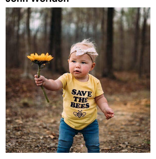
No need for words