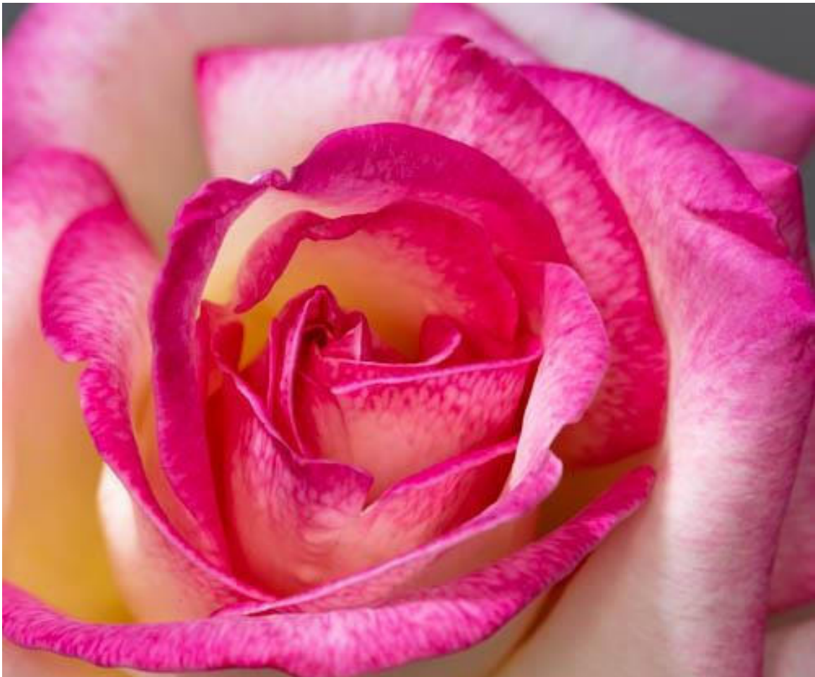
Double Delight Rose