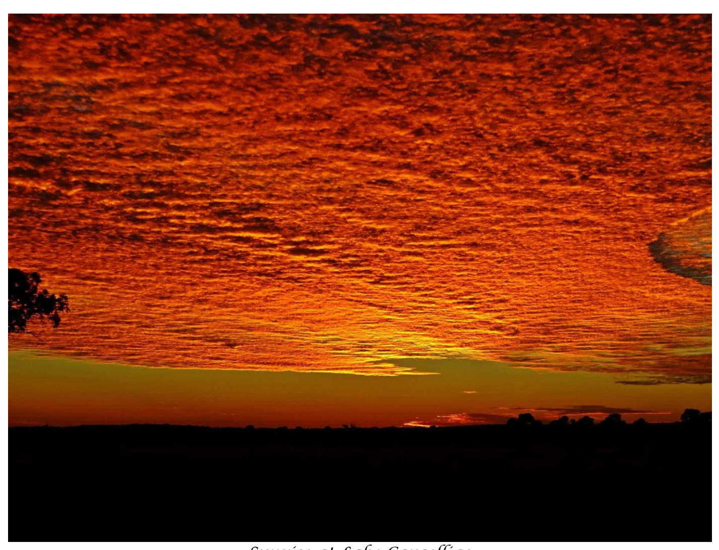
Sunrise at Lake Cargelligo