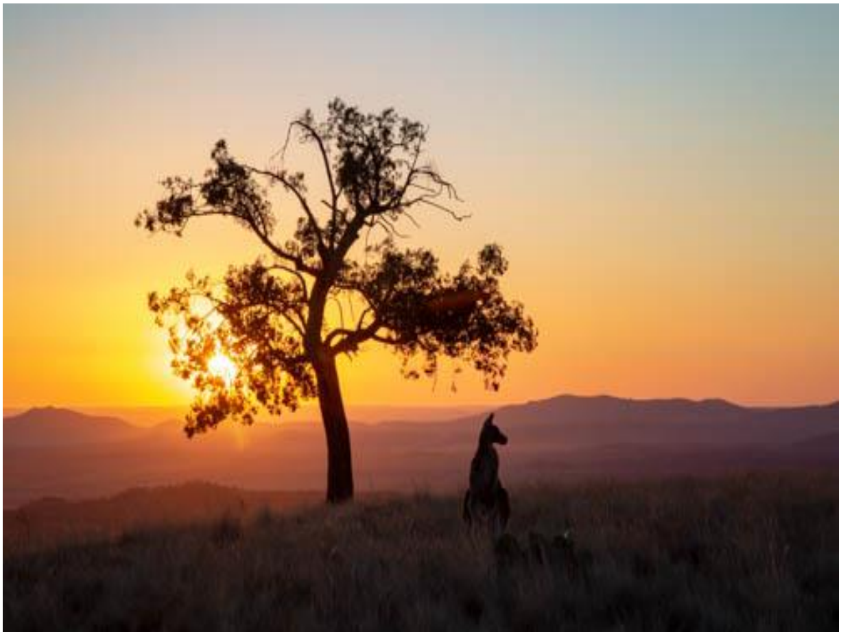
Mount Bora sunrise