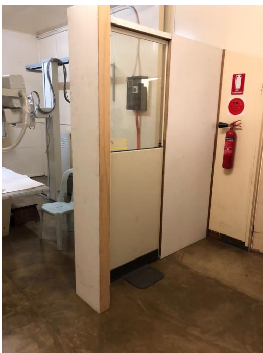
Work completed in the X-ray Room